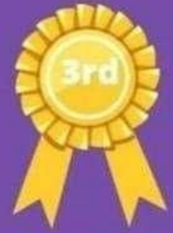
5th Sem Bsc Nursing