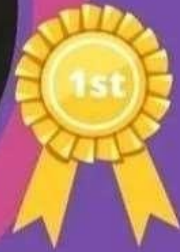
Renjana R 5th sem bsc nursing