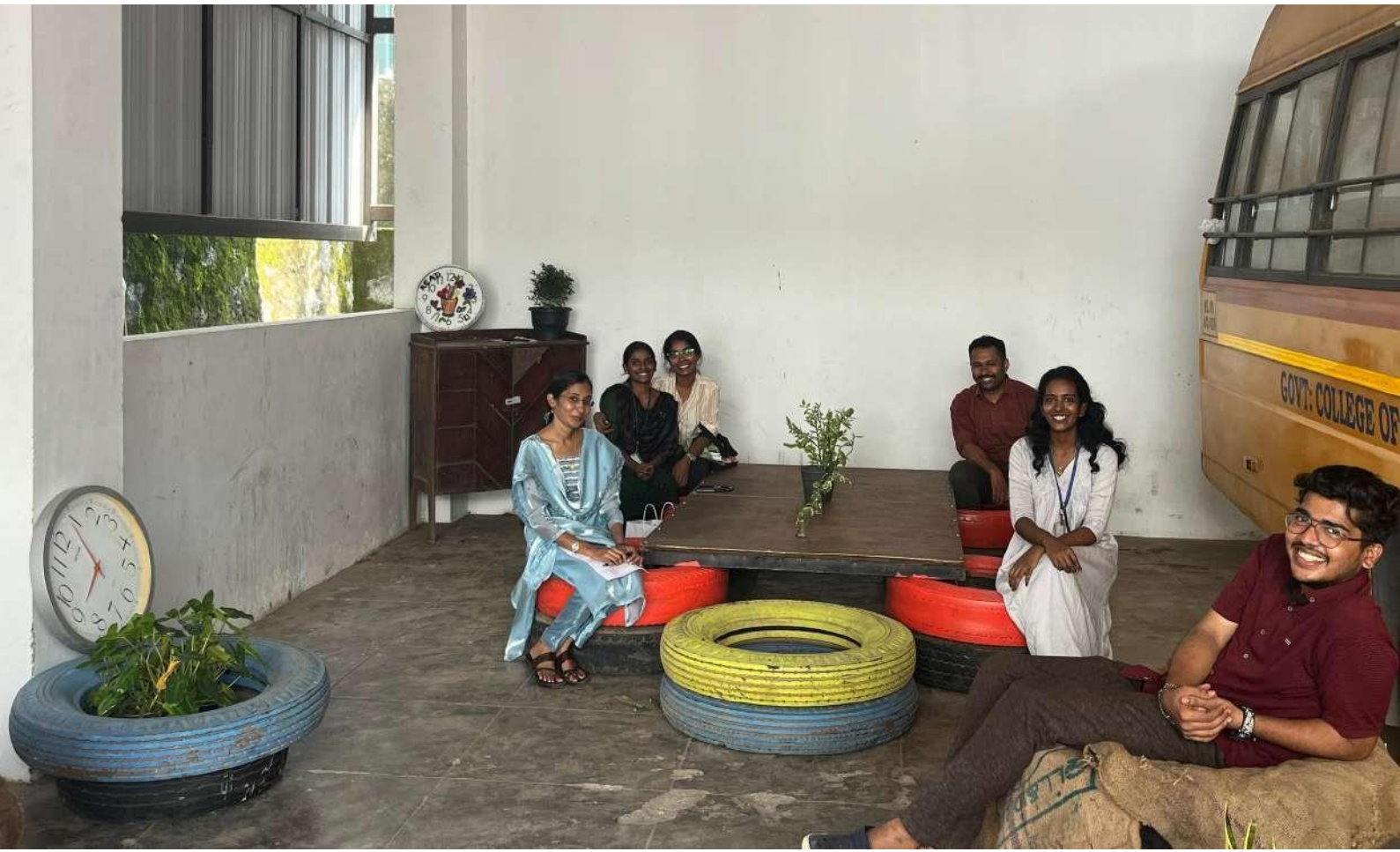
Union Inauguration day celebrated on November 18