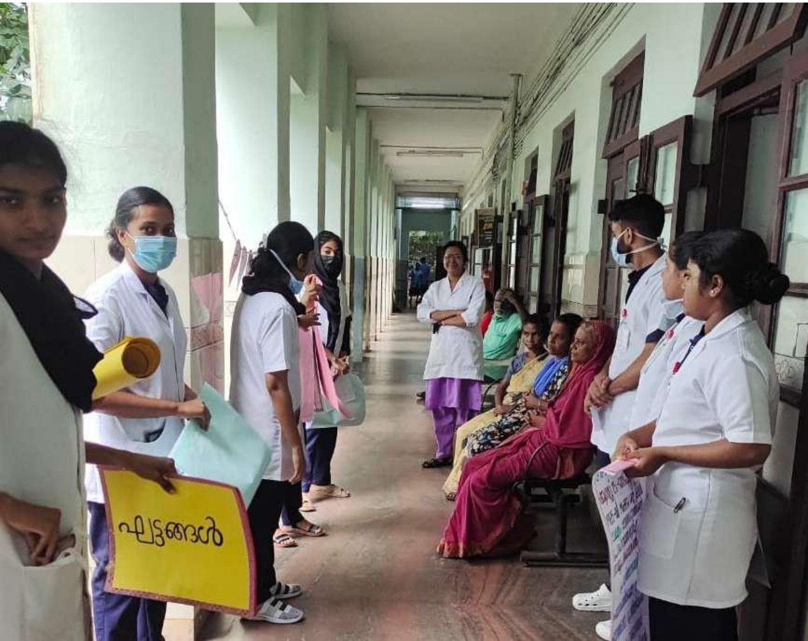
Teacher's day celebrated on September 5.